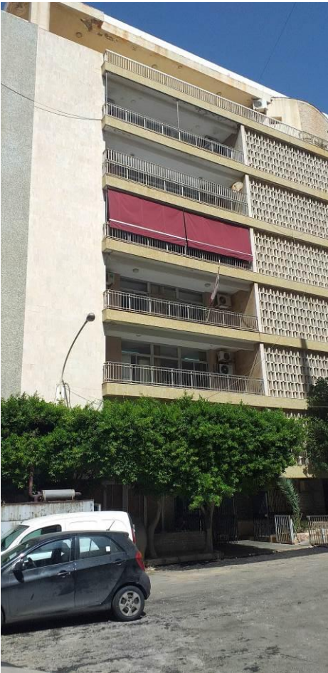
Figure 3: Building total floors