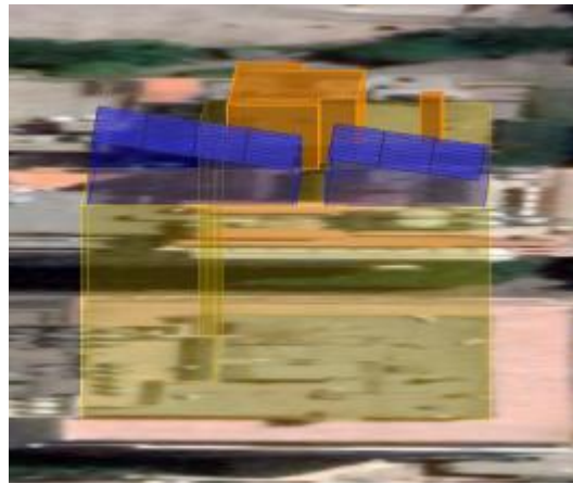
Figure 4: West side view of the proposed solution