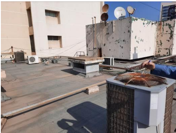
Figure 1: Available space on roof

The size of each Solar PV panel should be 550W. For the available area of 153sqm, the number of panels can be 56 unit. Thus, we obtain a total of 30.8kWp PV system.